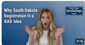
Why South Dakota Registration is a BAD Idea (And can get you in trouble)