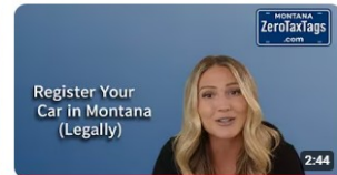
Register Your Car in Montana (Legally) – Skip Sales Tax & DMV Headaches