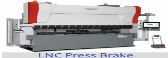
LNC Press Brake